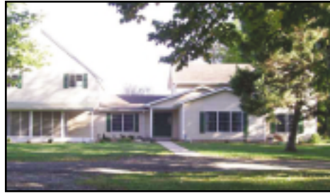
8 ACRE ESTATE 6181 Wesley Chapel has been completely remodeled with all new kitchen, main floor master with dreamy bath. 4+ bedrooms, 3 baths, office suite apartment. 3.5 car garage, excellent large storage buildings. $299,900.