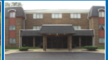
2650 COOPER Comfortable living in large 2 bedroom, 2 bath condo on Westside. Gorgeous kitchen and updated decor. Secure building. Many amenities. $61,900.