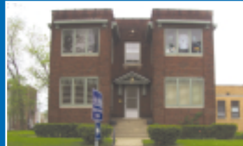
INVESTMENT PROPERTY, 619 South 5th All brick 6-plex, fully rented. Close to downtown, hardwood floors, sunporches, fireplaces, built-in china cab, & many updates. $149,900.