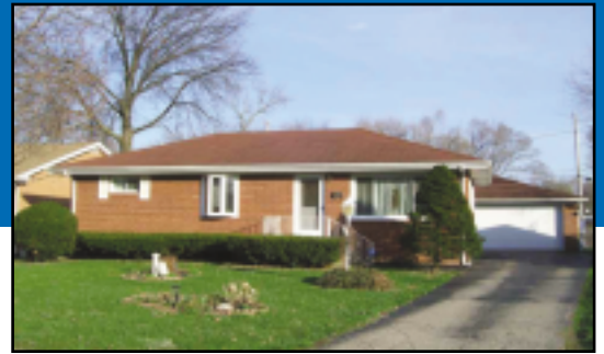
26 Monica Lane, Grandview Nice all brick ranch on quiet street of similar homes has full basement finished, & 2.5 car garage. $104,900