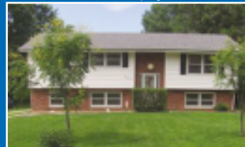
117 WILLOW ROAD, Rochester Complete remodel. Everything has been updated. Move in ready! Over 2900sf finished. 3BR/2.5BA, 2.5 car garage. $157,900.

MATT HOLCOMB 899-8470 mattholcomb@charlesrobbins.com