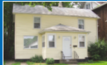
911 COLLEGE 3 bedroom home where every room is spacious & beautiful. Lovely kitchen and bath, newer windows and siding. Freshly painted. $54,900.

VACANT LAND: 1-3 acres Central Creek Rd. Starting at $24,900. All utilities on site.