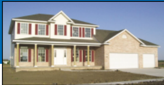
404 Windcrest, Chatham Almost Completed 2726sf new home with all wood floors on main level & 4BR on 2nd floor. Dreamy master suite. Island in 14 x28 kitchen w/granite counters. Every room is large. Full bsmt w/ convenient 2nd stairway in garage. Broker owned. $349,900