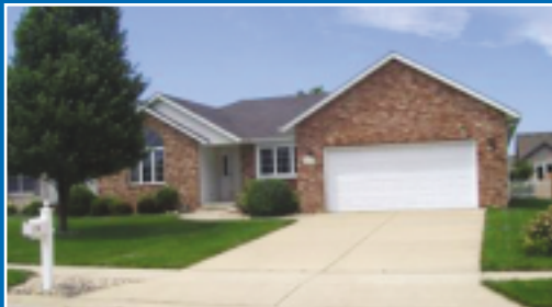
Deerfield Sub. 5309 TURNSTONE RD Open floor plan in this 3 bedroom, 2.5 bath home. Over 3000sf with finished basement. Fenced backyard. Just unpack and move in! $229,900.