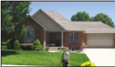
208 MANOR HILL DRIVE, Chatham Beautiful home with fresh decor and lovely landscaping. Huge well equipped kitchen with wood flooring. Finished basement with wet bar & game room & full bath. Covered patio. $254,900.