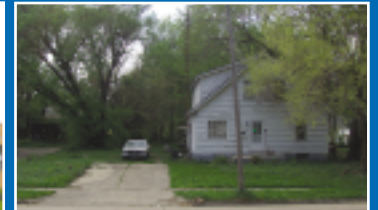
217 LINCOLN Great location and double lot. Flip this home or build a new home. Great lot to put new duplex. $19,900.