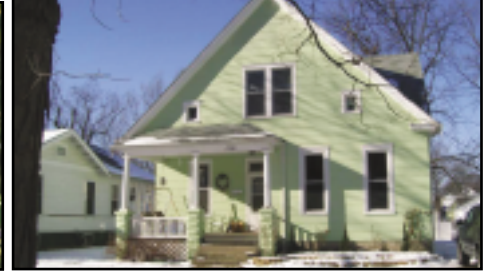
115 North State 4 bedroom, 2 bath home with recent updates including kitchen, roof, CA & fresh paint. Large 60' x 181' lot is fenced. $69,900.